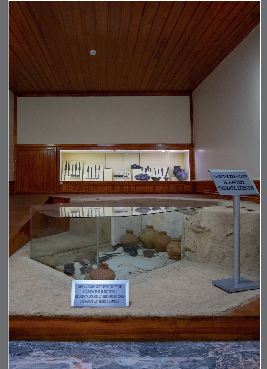
KRAL MEZARI REKONSTRÜKSİYONU M.Ö. 3000-2900 (ESKİ TUNÇ I) RECONSTRUCTION OF THE ROYAL TOMB 3000-2900 B.C. (EARLY BRONZ I)

Pottery, swords-wedges, spearheads, seals, idols, bones, stone and metal tools and jewelry unearthed from the cultural layers of Arslantepe Mound starting from the Chalcolithic Age to the Late Hittite Age are exhibited. Moreover, pottery, statuettes, stone and bone tools, casting molds, jewelry, etc. unearthed in the rescue excavations of Caferhöyük, Pirot, Değirmen-tepe, İmamoğlu, Köşgerbaba Mound as well as other artefacts obtained from other rescue excavations and findings such as pottery, metal artefacts, statues etc. of Urartu, Roman, Byzantine, Seljuk Periods brought to the museum are exhibited. Part of the museum at the ground floor houses an antique coin section arranged chronologically.