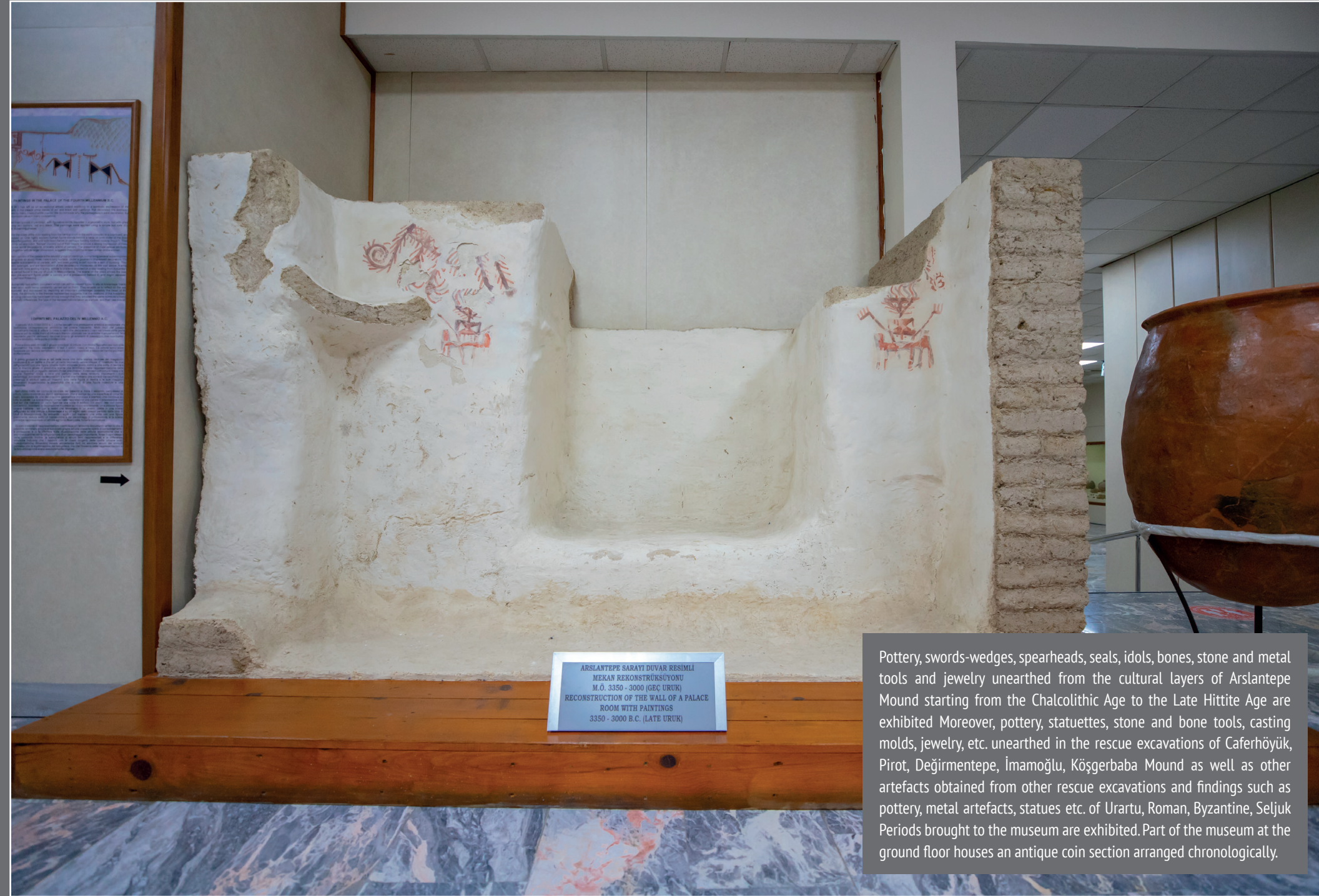
ARSLANTEPE SARAYI DUVAR RESİMLİ MEKAN REKONSTRÜKSİYONU M.Ö. 3350 - 3000 (GEÇ URUK) RECONSTRUCTION OF THE WALL OF A PALACE ROOM WITH PAINTINGS 3350 - 3000 B.C. (LATE URUK)

Malatya has always been an important place between Mesopotamia, where the oldest and the most advanced civilizations emerged in ancient times, and Central Anatolia. Malatya's geopolitical importance occupies a special place in terms of its location providing natural passages for prehistoric and historical caravan roads. Besides this geopolitical location, the contribution of water, which is an important factor in the development of civilizations, cannot be ignored. Malatya, where the Euphrates River, Tohma Creek and many other large and small streams pass through, has maintained its importance in Anatolia since 8000 BCE until today. In this respect, the artifacts in the Malatya Archaeological Museum shed light on the cultural history of the region.