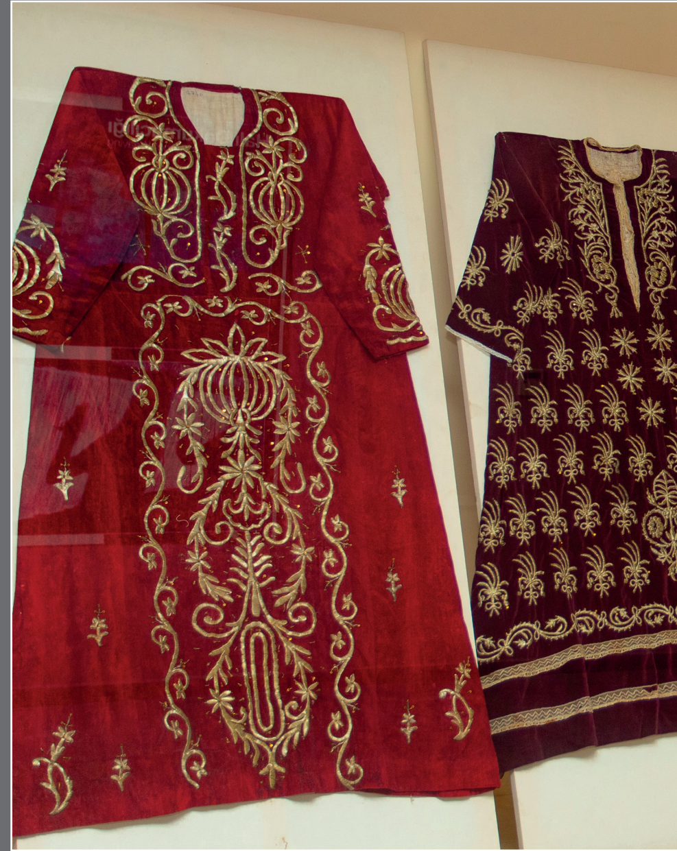
The Akhisar Museum has one story and consists of three main sections, namely archaeological artefacts sections, Ethnography Section and Arasta. The Akhisar Museum is waiting for visitors with its artefacts, majority of which have been discovered from Akhisar and its surroundings.