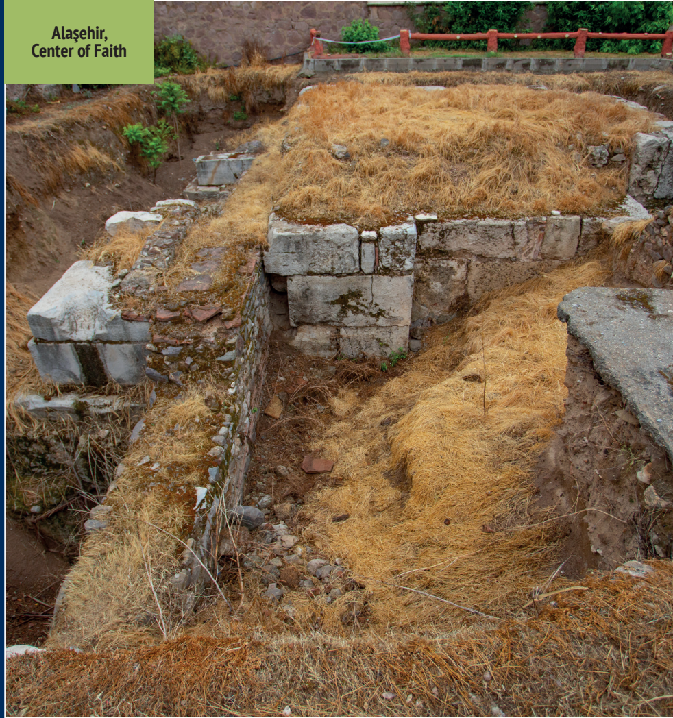
Alaşehir, Center of Faith