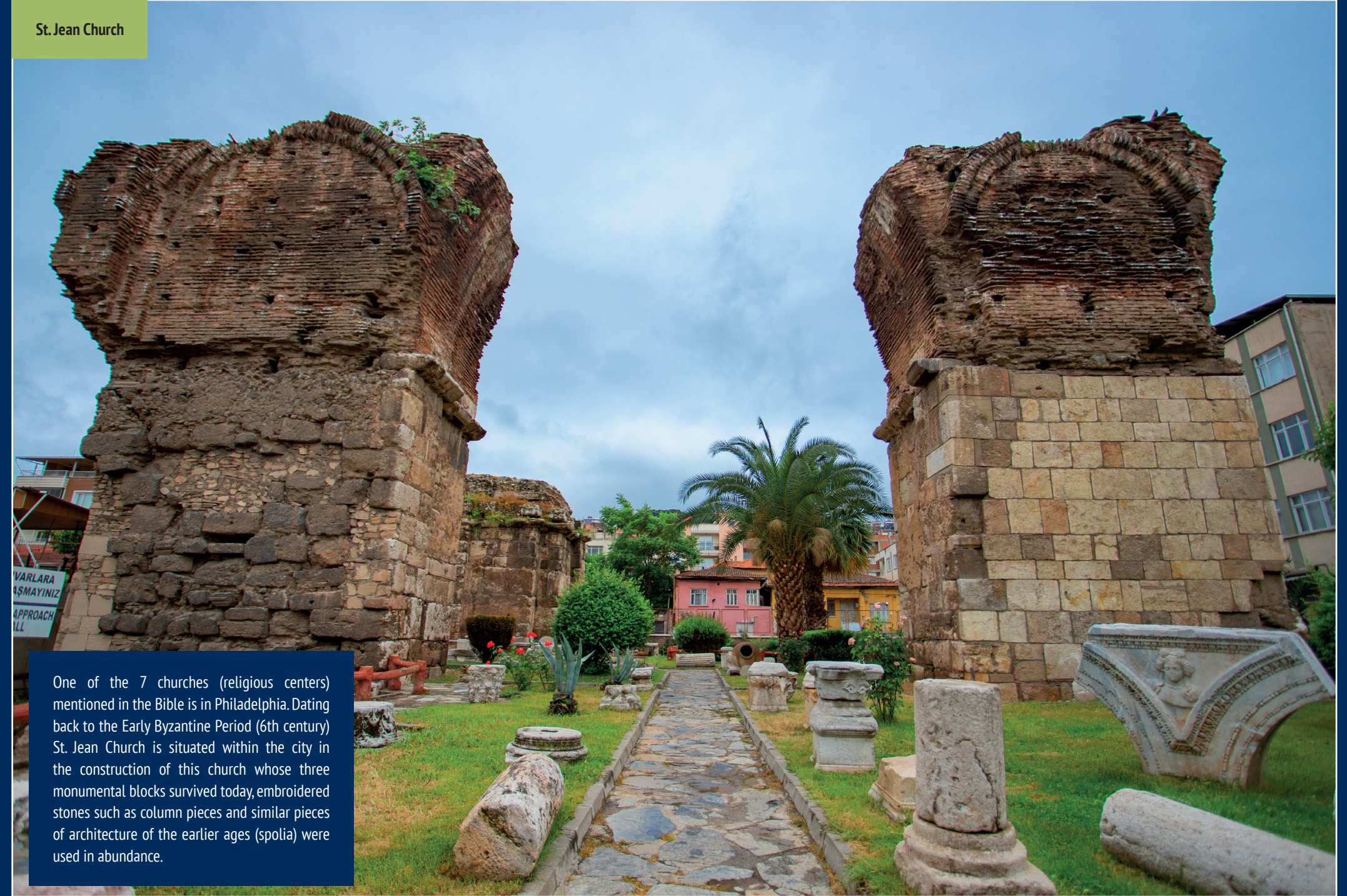
St. Jean Church

One of the 7 churches (religious centers) mentioned in the Bible is in Philadelphia. Dating back to the Early Byzantine Period (6th century) St. Jean Church is situated within the city in the construction of this church whose three monumental blocks survived today, embroidered stones such as column pieces and similar pieces of architecture of the earlier ages (spolia) were used in abundance.