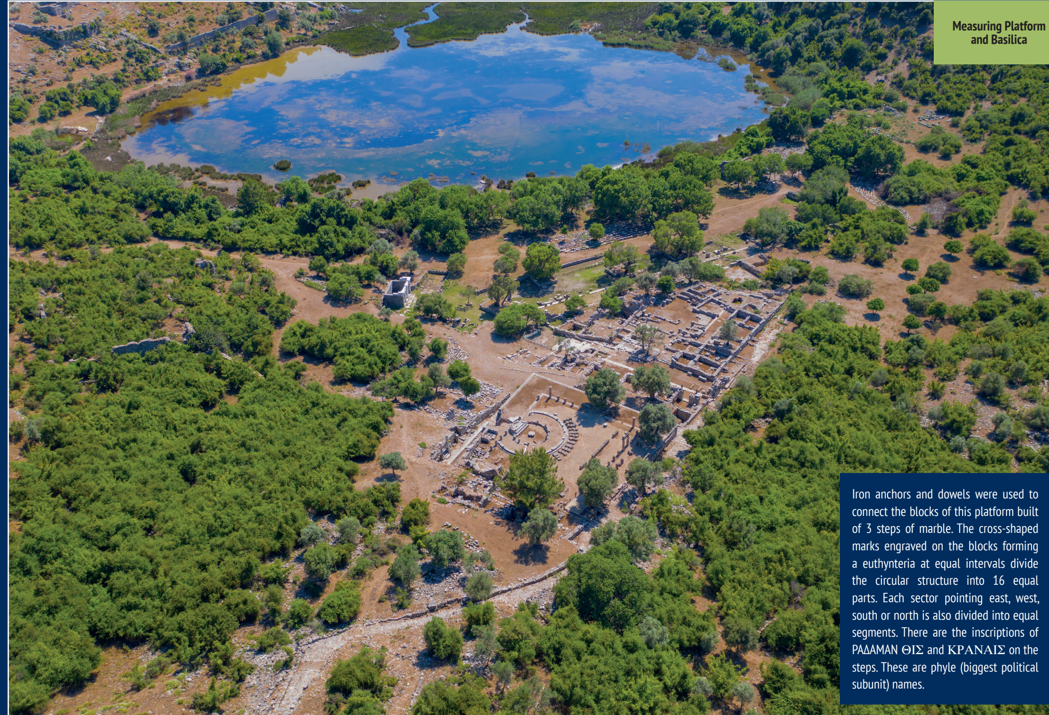
Measuring Platform and Basilica

Iron anchors and dowels were used to connect the blocks of this platform built of 3 steps of marble. The cross-shaped marks engraved on the blocks forming a euthynteria at equal intervals divide the circular structure into 16 equal parts. Each sector pointing east, west, south or north is also divided into equal segments. There are the inscriptions of ΠΑΔΑΜΑΝ ΘΙΣ and ΚΡΑΝΑΙΣ on the steps. These are phyle (biggest political subunit) names.